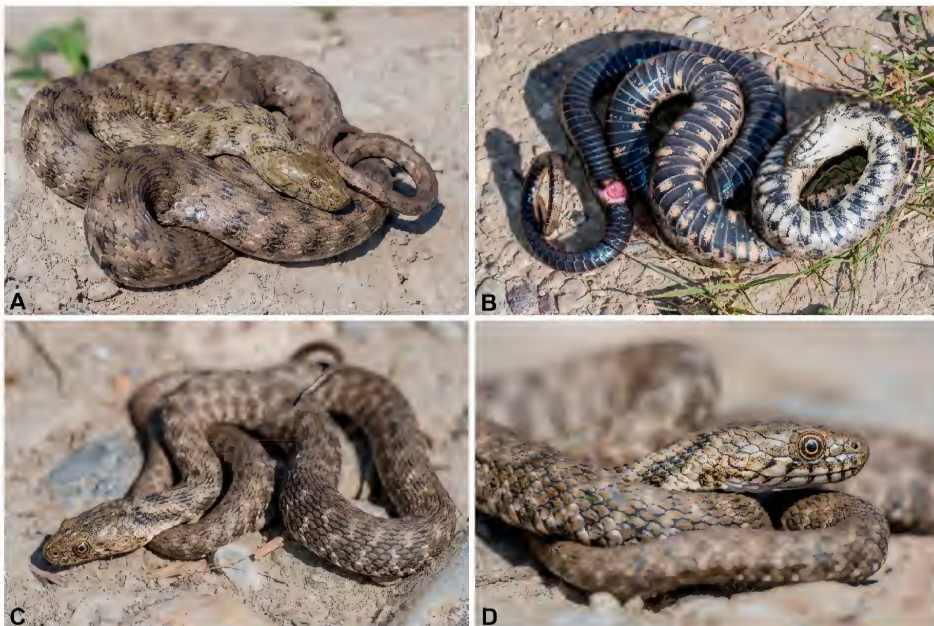
Fig. 3. Individuals of Natrix tessellata from the location in Lisková. (A) Adult female dorsal view. (B) Same individual in ventral view. (C) Overall view on juvenile individual. (D) Detail of the head on the same individual.

Coronella austriaca (Laurenti 1768), and Vipera berus (Linnaeus 1758) were also observed.